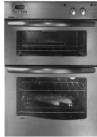
600 mm wide gas oven and grill – by New World