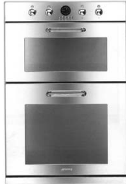
600 mm wide polished SS multifunction double oven by Smeg