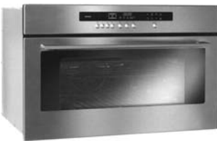
600 mm wide 'Compact' (i.e. low) single ovens available in various formats: self-cleaning multi-function oven, multi-function oven, steam oven, microwave oven which can be combined with one another or with standard size ovens according to choice – by Atag