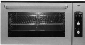
900 mm wide SS multifunction single oven with meat probe – by AEG