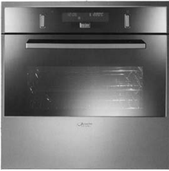
600 mm wide SS multifunction single oven – by Candy